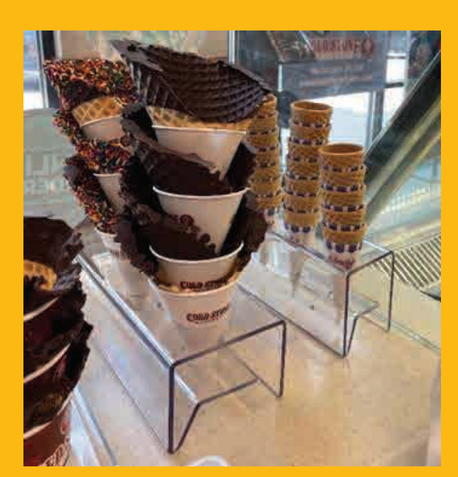
Small and kiddie cone racks in use.