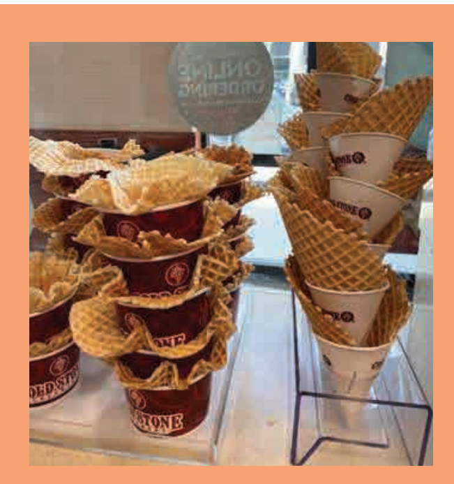
Waffle bowl tray and small cone rack in use.